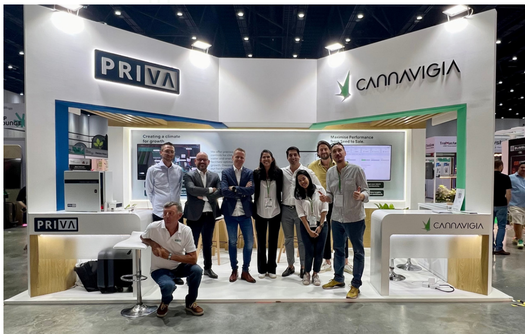
Joint booth with Priva at The International Asia Hemp Expo 2023 in Phuket, Thailand.

One of first integrations with the CONNECT API is a seamless connection with Priva's climate control sensors. This integration enables the Cannavigia system to display real-time environmental data from Priva devices, including temperature, humidity, and CO2 levels, as a crucial component of batch documentation. This advancement ensures comprehensive tracking and visibility of environmental data for each batch throughout various cultivation phases, accessible to diverse organisational functions. The value of this integration is already being demonstrated at the Cultivation for Compounds research consortium in the Netherlands.